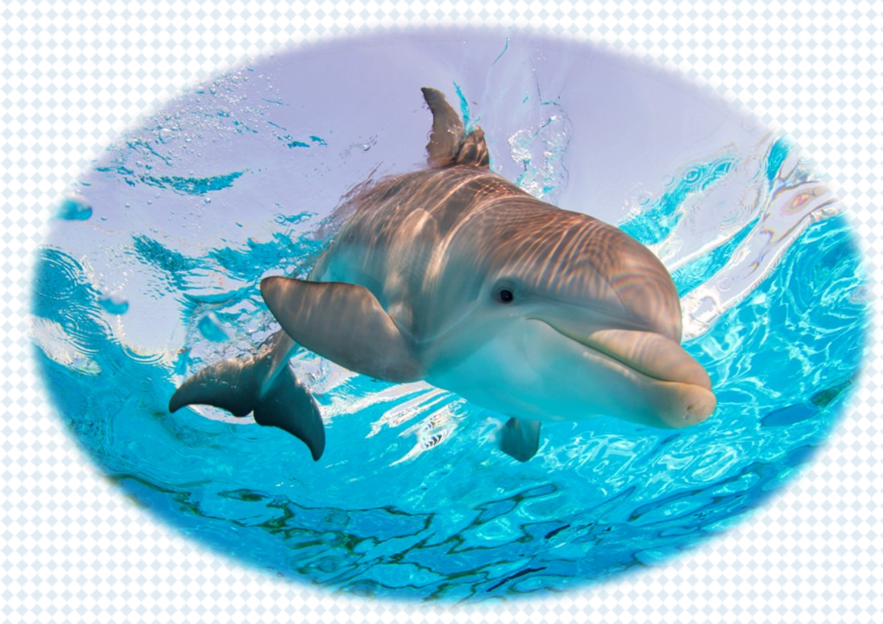
Bringing Up Baby By: